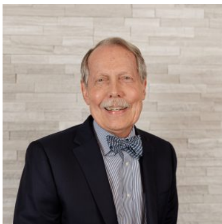
Gordon D. Gee Senior Counsel